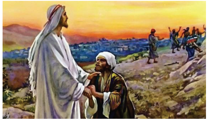
TWENTY-EIGHTH WEEK OF ORDINARY TIME